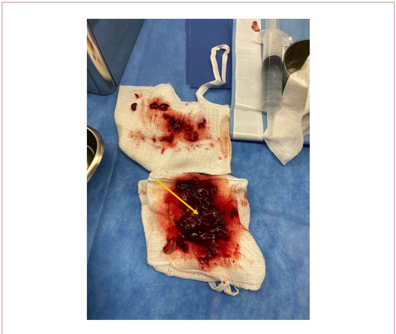
Figure 2 – Surgical specimen of the atrial myxoma (yellow arrow).